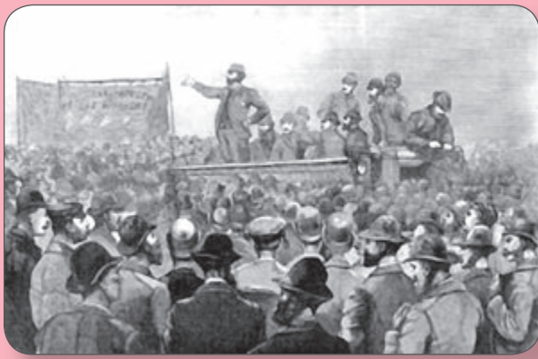
ILLUSTRATION: Illustrated London News , December 14, 1889